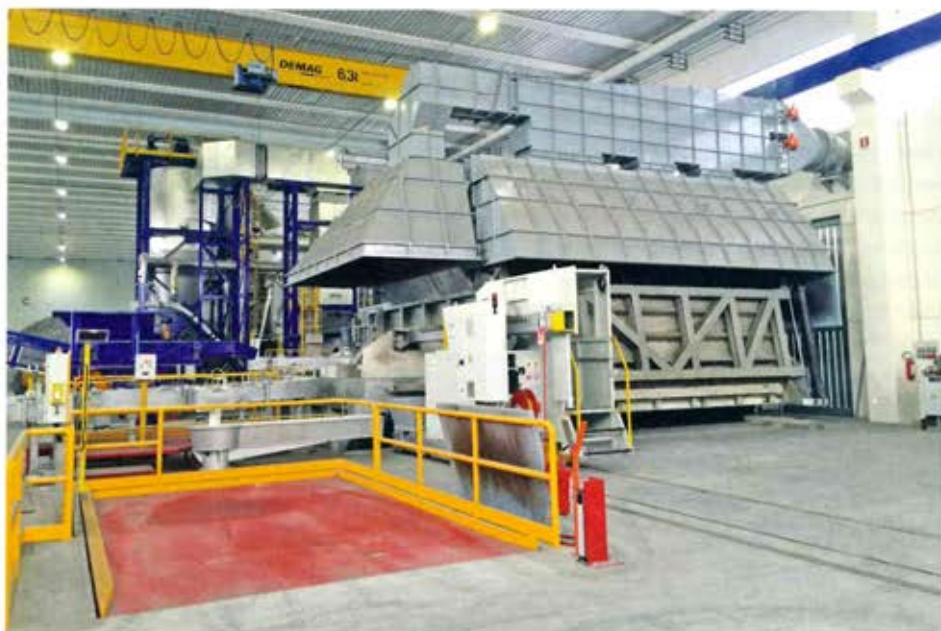
Archive photo of a similar melting furnace, with higher capacity, manufactured by Prezezzi a couple of years ago

Decreasing the percentage of solid inside the aluminium bath significantly reduces the capacity to absorb energy by the metal con-